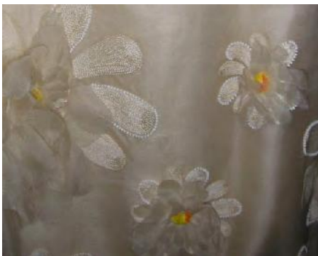
Above: The long organza skirt with "petals" and a detail of the embroidery and beadwork base.