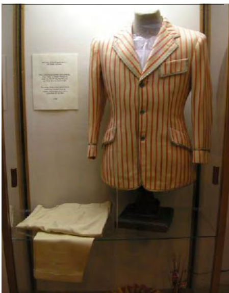
Below: Gene Kelly's striped wool blazer from Take Me Out to the Ball Game .