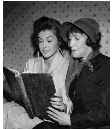
Esther going over script with Annette Kellerman.

One of her most famous films was the biopic, Million Dollar Mermaid , based on the life of the great swimmer Annette Kellerman. This association was particularly important to Esther because she had someone to share her special talents with - that of a great world class swimmer and as an actress, as Annette had made similar films in the silent era!