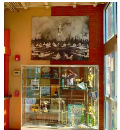
Above: The Culver City Municipal Plunge has a display in its lobby and one of its artifacts is a fabulous photo of "Hollywood's Mermaid," Esther Williams, on permanent loan from the Society.