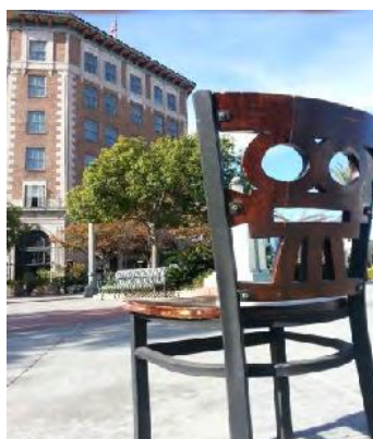
The "Camera" Chair

They are wonderful old hardwood chairs with a period motion picture camera fitted into the chair back.