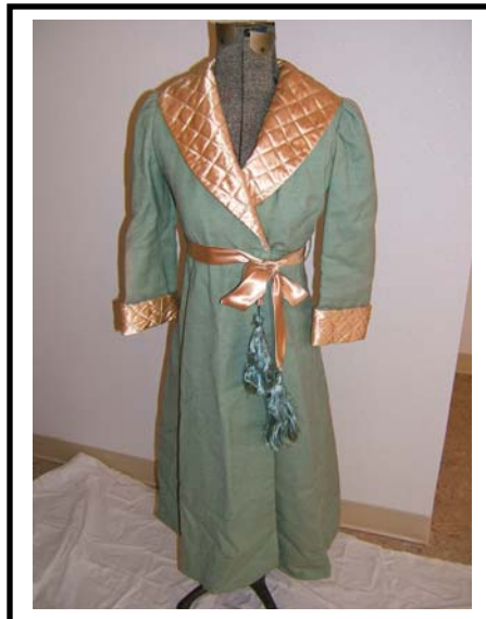
Robe worn by Margaret O'Brien in Three Wise Fools .

Plans for the future include maintaining museum-quality storage standards, and the acquisition of professional display forms and cases so that these marvels can be appreciated when the Culver City Historical Society "ARC" opens to the public. ###