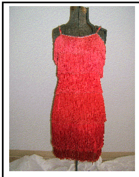
Red fringe dress worn by Doris Day