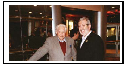
Budd Schulberg with Leonard Maltin.