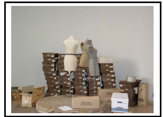
The costumes are brought down from the Tower!