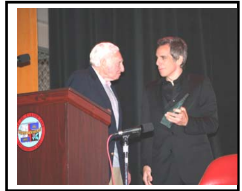
Ben Stiller, at right, presents the "Thomas Ince Award" to Budd Schulberg at 2nd Backlot Film Festival.

history of the Selznick, Mayer and Schulberg families. The award was presented to Budd by actor Ben Stiller and there was an Opening Night interview with film critic and historian, Leonard Maltin.