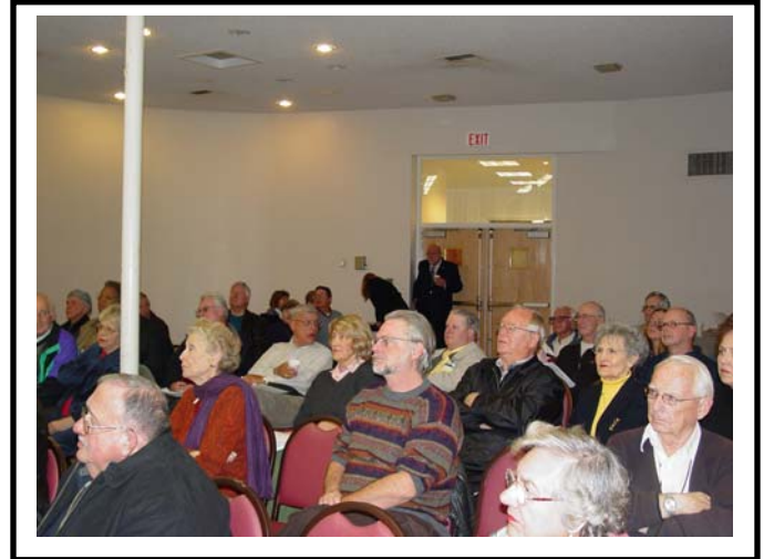
The January 18 th General Meeting was the first to be held in our new “digs” – the Culver City Historical Society Archives and Resource Center (ARC) at the Veterans Memorial Bldg.