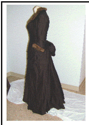
Black bustle dress was from The Brothers Karamazov .