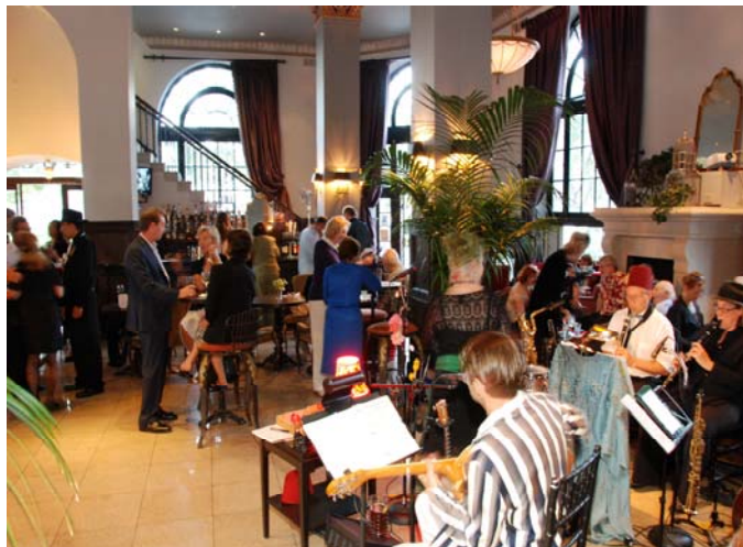
The Culver Hotel buzzed with fun and the music of "Doozy."

Setting the mood with sentimental tunes, Doozy, a band playing sounds of the 1920s and 1930s, kept guests entertained with dancing and listening tunes while waiters traversed the room with bountiful trays of appetizers. (cont'd. pg.5)