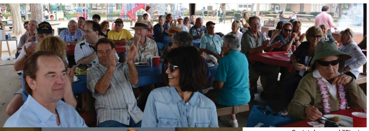
Society's annual "Picnic in the Park" on July 27.