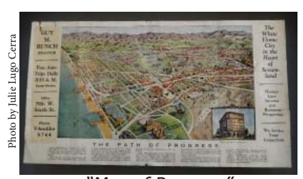
"Map of Progress"

We are lucky to have many generous contributors! Our newest